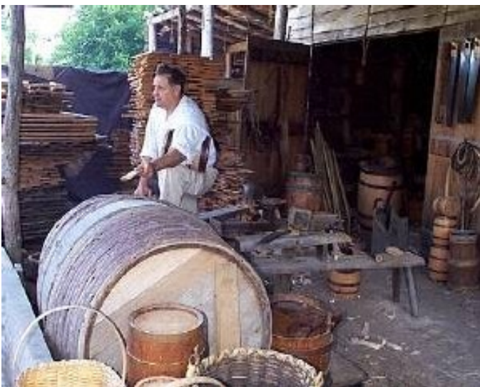
A modern hogshead replica.

The crop regularly sold for a penny a pound or less right