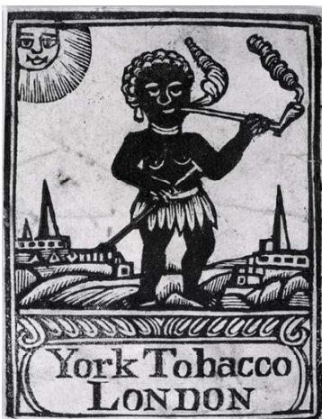
Seventeenth century tobacco ad by Francis Bedford

up to the passage of the 1730 Tobacco Inspection Act. In 1731 Virginia exported 34 million pounds of tobacco that sold for as much as 12 shillings 6 pence per hundred pounds. A previous all-time record crop of 29 million pounds was produced in 1709 despite the fact that four years earlier many planters took one quarter of a penny per pound for their crop.